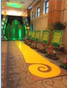
"There's No Place Like Home"