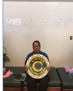
Touring the International Research Center