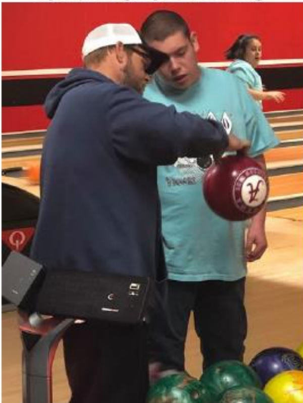
CHAMPIONS OF SERVICE