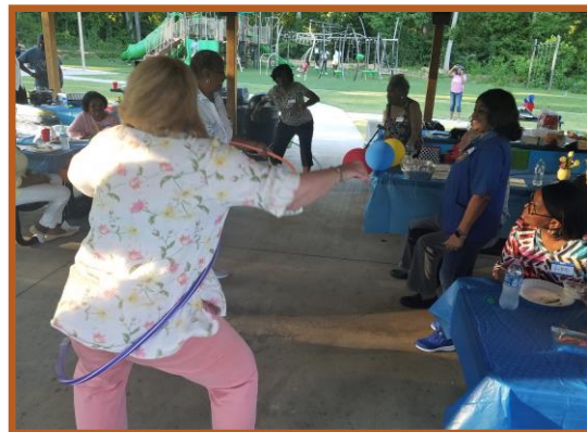
Let me show you how!!