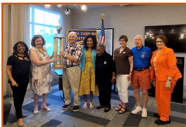
Greenville Club accepting the Governor's Trophy