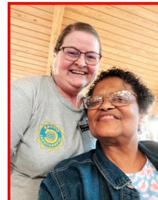
High School friends reunited!