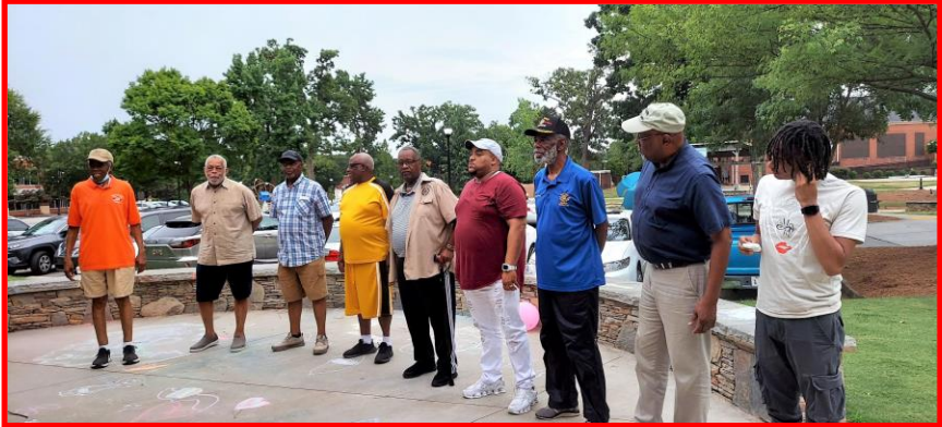
Do we really want to know who has the prettiest legs!!