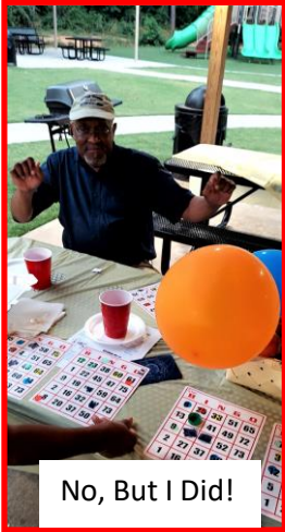
No, But I Did!