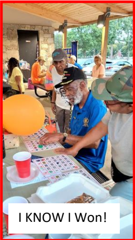
I KNOW I Won!