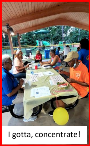
I gotta, concentrate!