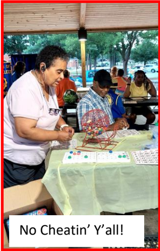
No Cheatin' Y'all!