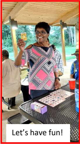
Let's have fun!